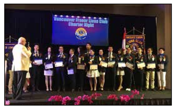
2019 19-A Vancouver Fraser Charter Night Celebration